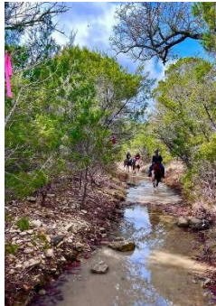
Trail down the creek