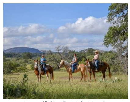
Beautiful trail at Inks Ranch

Robert Inks, knocked Saturday evening's meal out of the park with aoudad and pork street tacos sourced from the ranch, and I think everyone went to bed with a full belly. The weather cooperated, too, with drier air, a decent breeze, good cloud cover and temps in the low 90s, which was a far cry from last year's high of 108 on Sunday. And I can't say enough good things about our volunteers; we were a little short on 4WD transportation, but they carried on and got our judges where they needed to be...usually on time! The scenery at Inks never fails to take my breath away, and I'm sad we won't be back next year. But Leah and I are looking forward to going "back to the granite" in 2026!