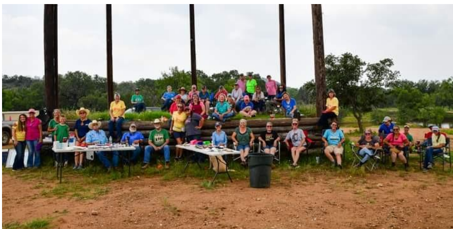
Camp Reveille on Sunday