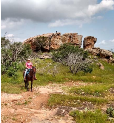
First time competitor Jackie Bonner at "Buzzard Rock"

reviewed by flashlight when the power went off! The trails were over granite outcroppings with beautiful wildflowers, and sandy stretches of tree lined paths. Although the weather was humid, there were nice breezes with overcast skies, A perfect ending to the Spring ride season!