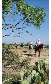
Riders at San Angelo State Park

What a wonderful (and hot) Cactus Two Step for judges and riders alike. We beat the heat with an early ride out which kept everyone happy. Riders executed obstacles from simple to complex with amazing talent! Fun was had with the "Robin Hood Returns" bow and arrow challenge, doing a serpentine maneuver in the river and jousting like Medieval Knights. Watching such competent riders complete turns on haunches/fore and beautiful side passes was a joy. Saturdays learning moment was about Search and Rescue followed by delicious local barbecue for all. The ride managers put together an amazing ride in the scenic San Angelo State Park. A heartfelt thank you to all who attended, volunteered, secretaried and judged.